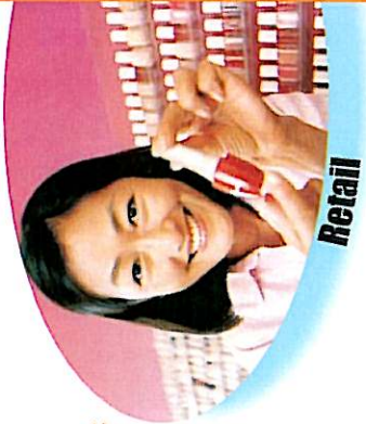
Training & work experiences are paid.

This initiative is funded through the Youth Skills Link program of the Government of Canada.